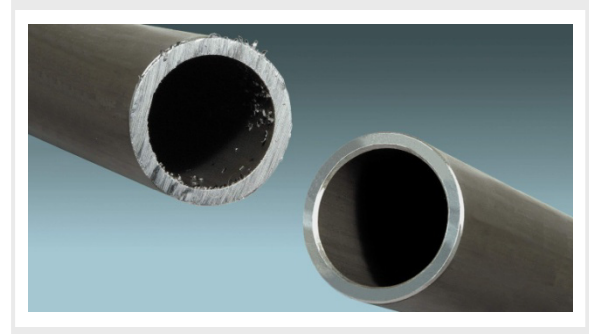
Application: clean internal and external deburring of steel pipes after cutting.